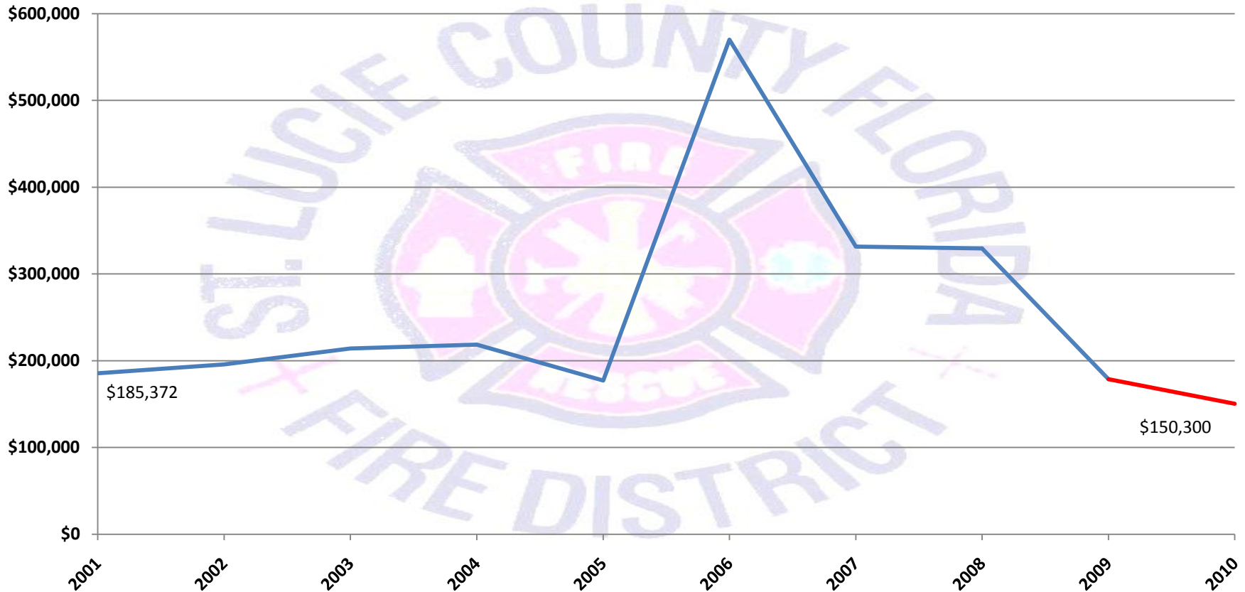
Buildings & Grounds - Expenditures